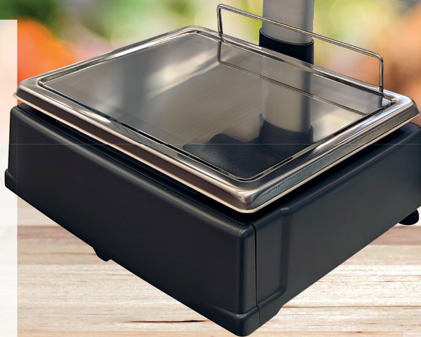
Plate dimensions: L360 x W280 mm. Weight with packaging: 12.0 kg.