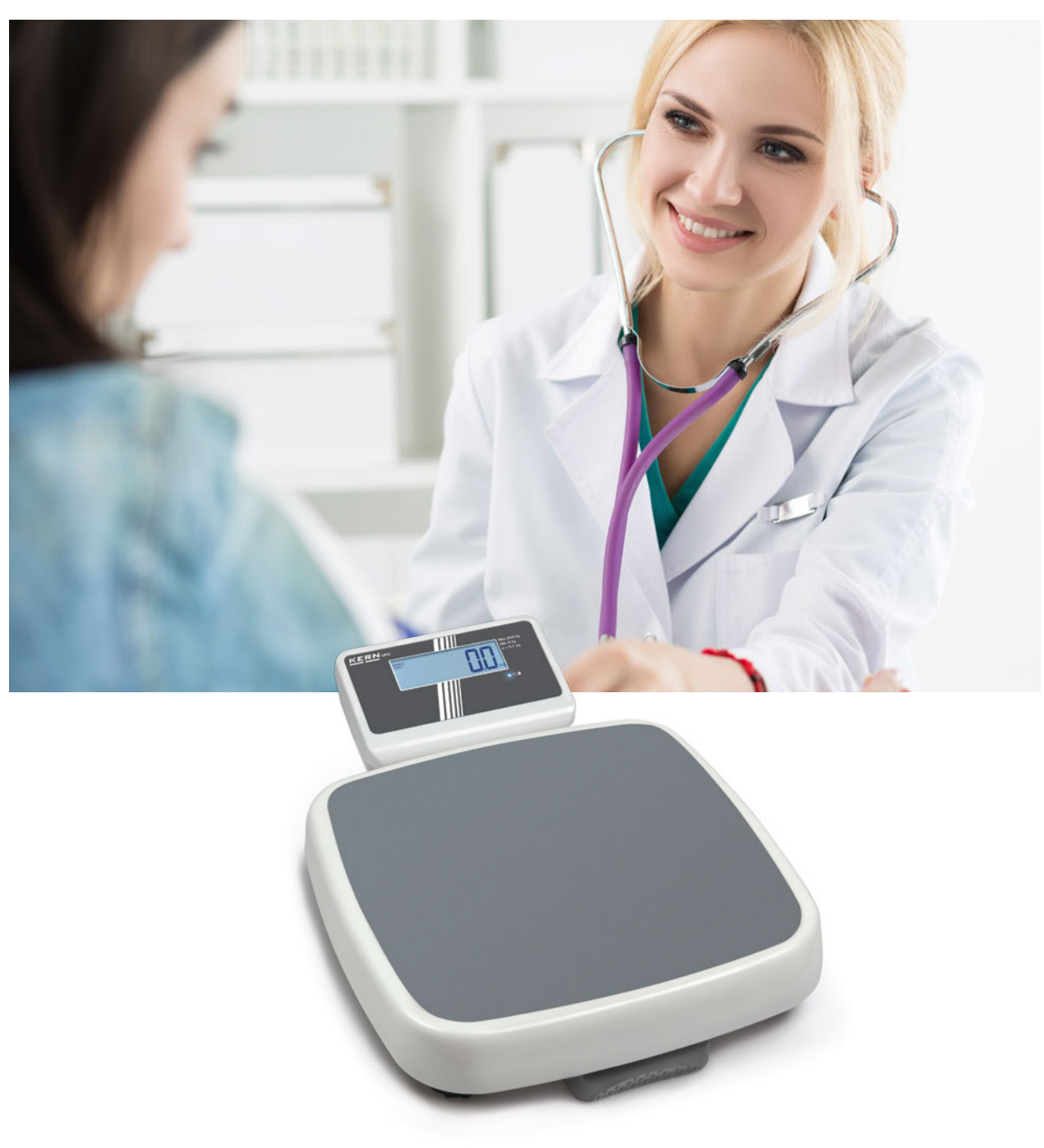
KERN MPD 250K100M

Professional step-on personal floor scales approved as a medical device and with EC type approval class III