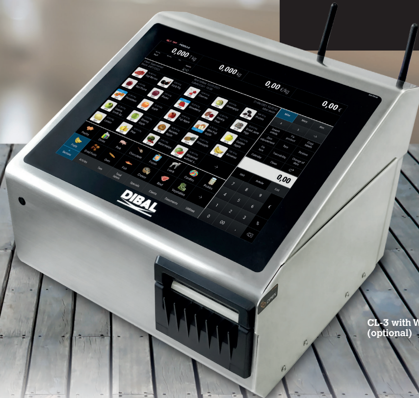
CL-3 with Wi-Fi (optional)