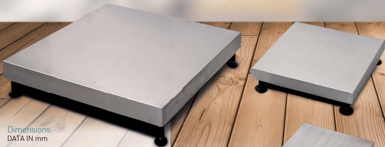
Dimensions DATA IN mm