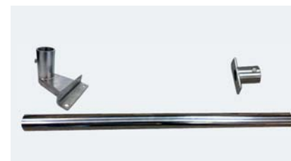
S. steel column kit for DMI-610 S. Steel and DMI-620, and Cely VC-80 I indicators