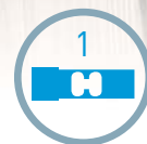
1 LOAD CELL