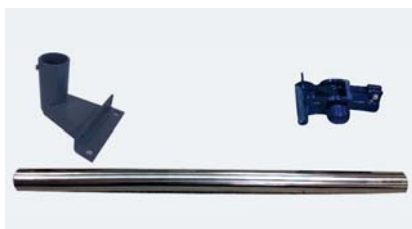
Iron column kit for DMI-610 BASIC ABS and DMI-610 ABS indicators