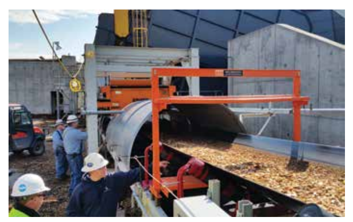
▲ A 1200 Series metal detector and a suspended magnet protect downstream equipment from tramp metals.

Eriez industrial metal detectors have applications in industries including food, packaging, minerals processing, aggregates, coal, ceramic, chemical, glass, pharmaceutical, plastics and rubber. Eriez offers metal detectors suited for the specifics of your application to detect and remove ferrous and nonferrous contamination.