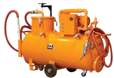
Sump Cleaner Vacuums chips from the sump and filters coolant for fast and easy sump cleaning