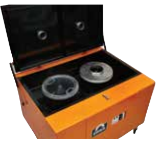
Rotor Bowl Centrifuge Rotor bowl centrifuge removes sludge in grinding, honing and finishing operations