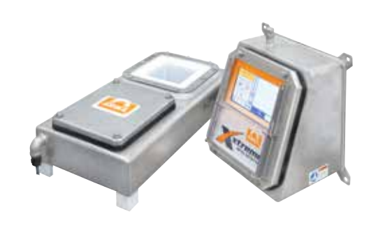
Xtreme Vertical Detectors ideal for detection and removal of ferrous, nonferrous and stainless steel metals in gravity-fed dry products such as plastic flake, grains, nuts, powders, etc.