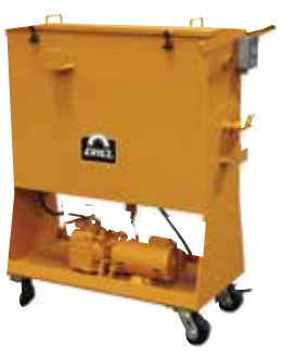
Portable Coalescer High volume removal of free oils and fine particulates