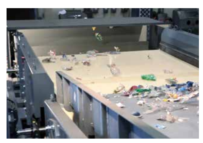
Eddy Current Separator sorts aluminum cans in a recycling facility.