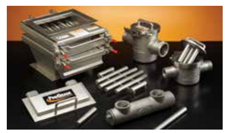
Small Magnetic Separators effectively remove tramp iron in both liquid and dry processing applications.

Magnetic equipment is commonly used to remove dangerous unwanted metal contaminants from product flows. This equipment is also widely used in Resource Recovery applications to sort and reclaim valuable metals.