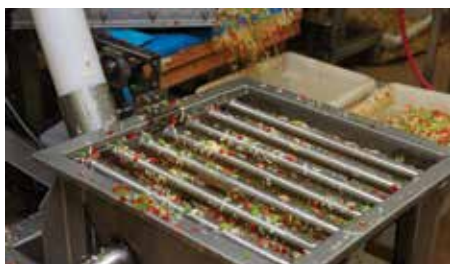
Grate Magnets used in food preparation at Better Baked Foods. Grate Magnets provide powerful, permanent protection against fine and tramp iron contamination.