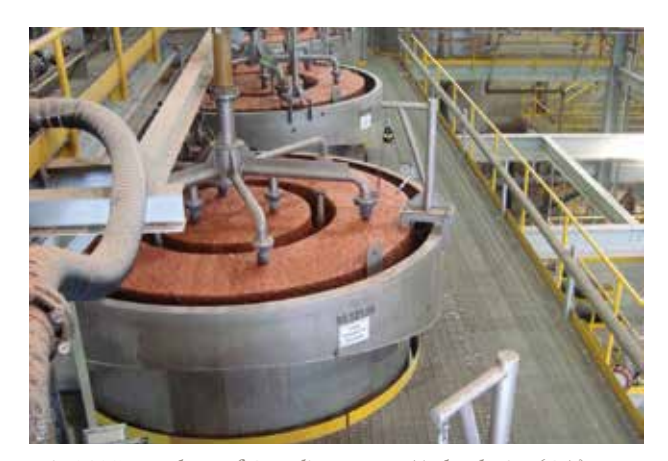
Eriez' 2007 purchase of Canadian Process Technologies (CPT) established the Eriez Flotation Division as a market leader for both fine and coarse flotation.