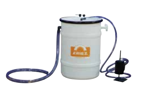
Tank Side Coalescer Allows tramp oils to naturally separate outside of turbulent sumps