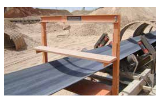
I 200 Series Metal Detector detects large tramp metal for the aggregate and mining industries.