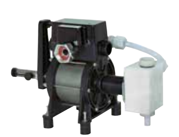
Concentration Controls Mixing and proportioning units to simplify coolant dispensing