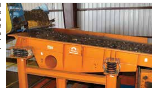
Mechanical Feeders present an even flow of material to an automated sorter at a scrap yard.