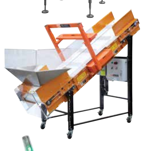
Metal Detector Conveyor convenient detector conveyor unit rolls into position to protect shredders, grinders and granulators.