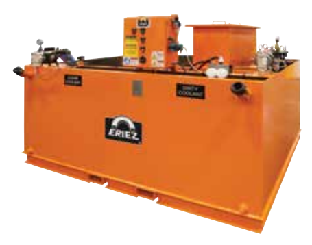
Coolant Recycling Systems Self-contained coolant and fluid management systems capable of recycling any water-miscible fluid to its maximum potential.

Two-phase cleaning operation to remove chips, oils, and fines, then replenish sump with clean fluid