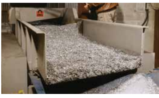
Mechanical Conveyors receive aluminum at a foundry in New York.