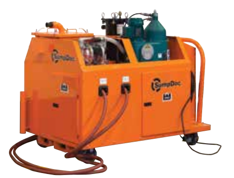
SumpDoc™ Inline Recycling and Filtration

Two-phase cleaning operation to remove chips, oils, and fines, then replenish sump with clean fluid