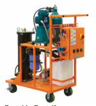
Portable Centrifuge Removes free and emulsified tramp oils through a high speed centrifuge