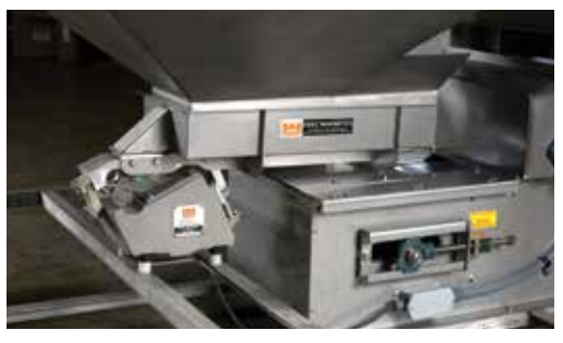
High Deflection Feeders are designed to feed difficult materials like powders as well as sticky and leafy products.