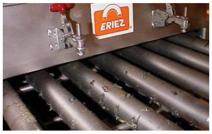
▲ Grain mill uses Xtreme Rare Earth grate magnets to remove metal contaminants.

▼ Suspended electromagnet removes tramp metal at an aggregate plant.